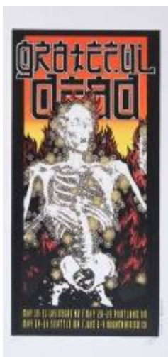
Grateful Dead by Alton Kelly

Alton Kelley contributed some 11 posters to the series, including this incredible Grateful Dead piece, a large poster.