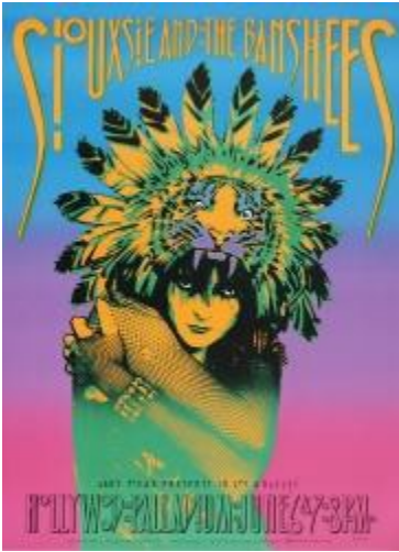
Siouxsie by Victor Moscoso

The first poster in the series is a killer one by Victor Moscoso. This large and gorgeous poster is a beauty, immediately followed by a 2nd Siouxsie poster by Stanley Mouse. Another great poster.