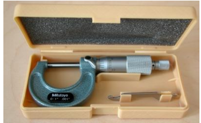
Micrometer -- measures thickness

Micrometer -- You don't need this device, unless you are discriminating variants for rare posters such as some in the Family Dog and Bill Graham (BG) sets. In these special cases, it can be important to know the thickness of the paper the poster is printed on, and this is what micrometers measure.