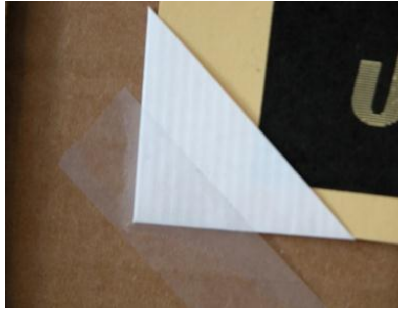
Mounting the corner

Using this method, the poster is securely held to the board by the four corners, but no tape touches the poster. Some put the poster in a clear plastic bag and then put the bag to the board, using the four corners method.