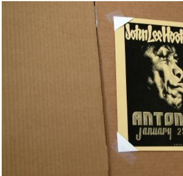
Good way to mount poster to board

The most common and a very safe way to pack posters is also very inexpensive and simple. You just take a common mailing envelope, and cut off the four corners. These corners are then used to position and hold the poster on the inside of the cardboard sheets. Place four cut corners of the mailing envelope over the four corners of your posters. Place the poster on the inside of one of the cardboard sheets and tape those corners (not the poster) to the board.