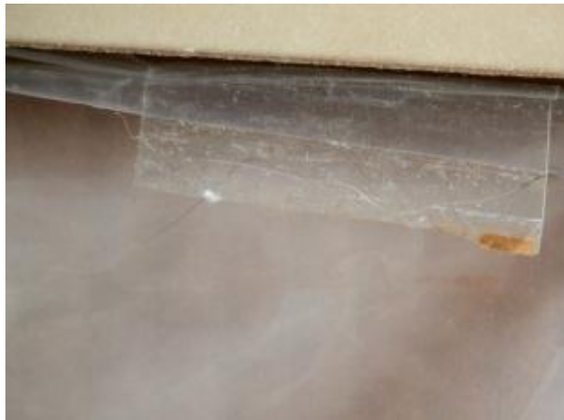
Beware the loose transparent tape!

So, be careful when you remove a posters from a taped bag!