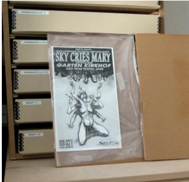
Dangers of tape and plastic

So, be careful when you remove a posters from a taped bag!