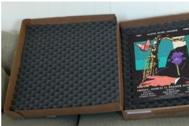
Custom Shipping Container

Here is a heavy-duty cardboard box that has custom-fitted pieces of foam, with protruding fingers. There is a foam piece above and below the posters. Where the fingers of the foam pieces meet is where you place the posters. The foam fingers press together to hold the posters, kind of suspended between the fingers. This kind of box works well if the number of posters is not too many. Too many posters, and the foam fingers cannot maintain a pressure, causing the posters to slide and bent corners result.