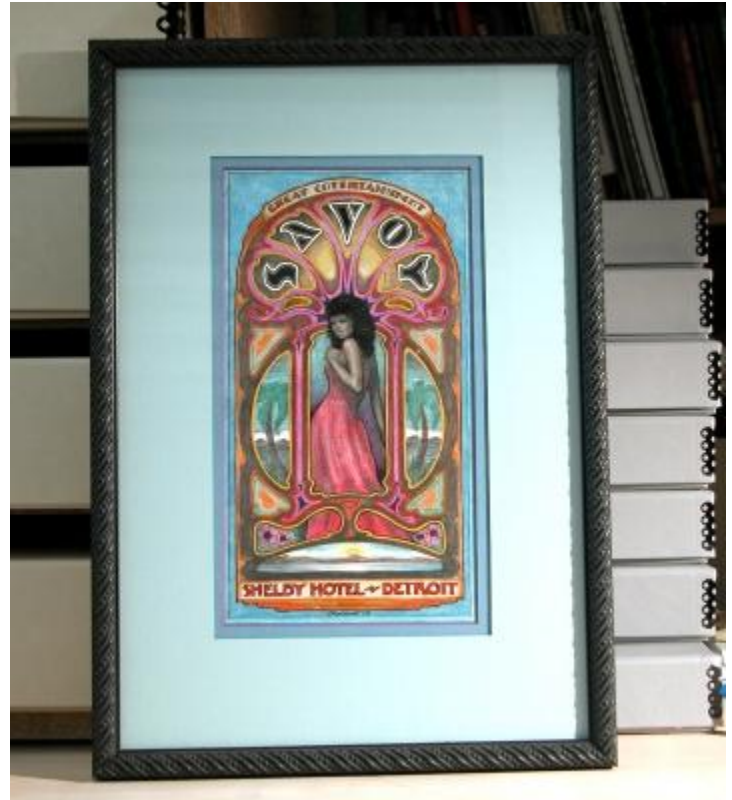
A Piece of Original Art, Matted and A Piece of Original Art, Matted and Framed

Matting -- The mat board is not simply cosmetic. It serves an essential function, that of keeping the glass or Plexiglas raised and away from the poster surface. It is important that the mat board be thick enough to serve this purpose. Always use archival mat board, which means the board will not chemically react to the paper/inks of the poster. Also, always make sure the mat is at least 3/4 inches larger than the poster itself, to allow for the natural expansion and contraction of paper with routine temperature changes.