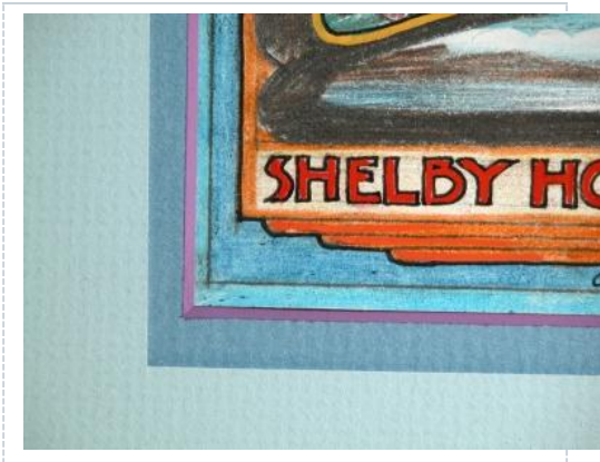
Double Mats raise the glass from the Poster Surface

It is perhaps sad, but seems to be true, that most (certainly many) collectors don't mat and frame all that many posters. They tend to squirrel their posters away from sun and eyeballs, confined to safe storage of one type or another.