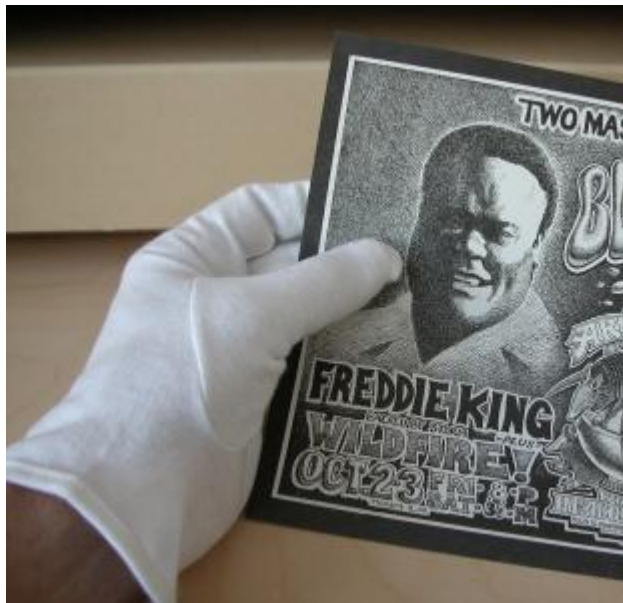
Cotton gloves are useful

Cotton Gloves -- Not needed for a lot day-to-day handling of posters, you may want them if you are handling very expensive or very old paper, since the transfer of body oils is more detrimental and the harm done more immediately visible. I use gloves for the very rare stuff.