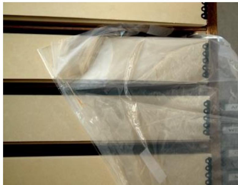
The maverick bag

The 'Good Tape' -- You can see it. Another word of warning to those new to collecting. When you first start out, you don't have that many ways to store your posters. It is very tempting to want to somehow salvage these taped plastic bags and to reuse them for storage. This can be a big mistake. Those old tape ends can sneak up on you and grab at your posters. Just throw any bag that has had tape on it in the trash.